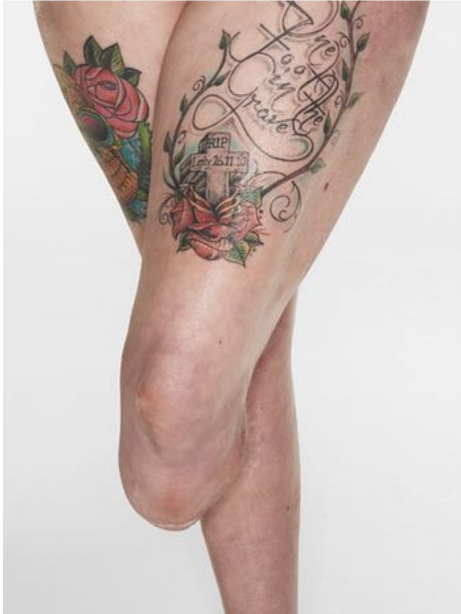
© Sofie Middernacht and Maarten Alexander

So how can we shift the negative images of disability and sexuality that still dominate society’s attitudes? Disabled people and their allies have been campaigning for change for decades. While it is not going to be easy, change is on the way, but with it comes new controversies.