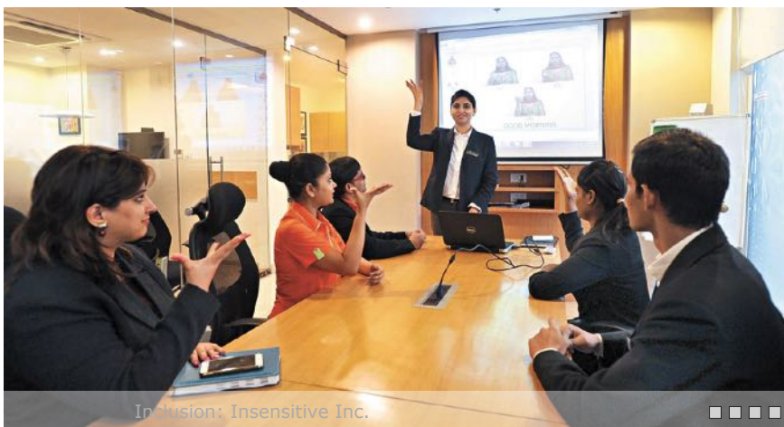
Inclusion: Insensitive Inc.